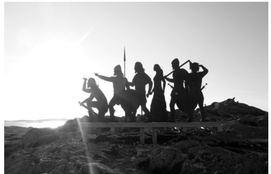
Steel sculpture on the hill next to the Norse site in L'Anse aux Meadows