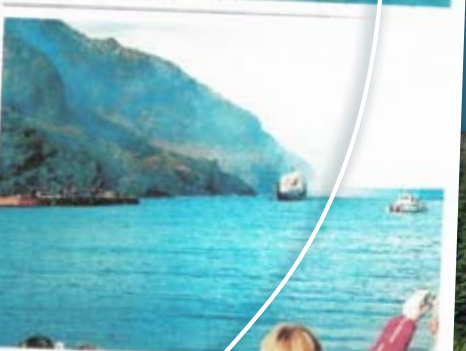
Photos from the movie shooting, scanned and printed by a lady at Lark Harbour town hall from a printed scan of photos taken by a local resident