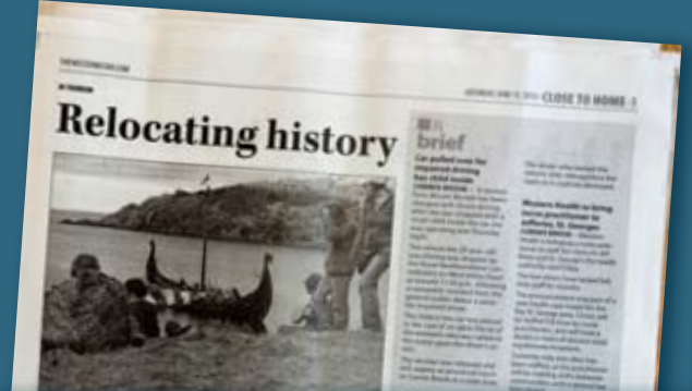
Photo of the Viking ship in front of the Lark Harbour town hall from 2011