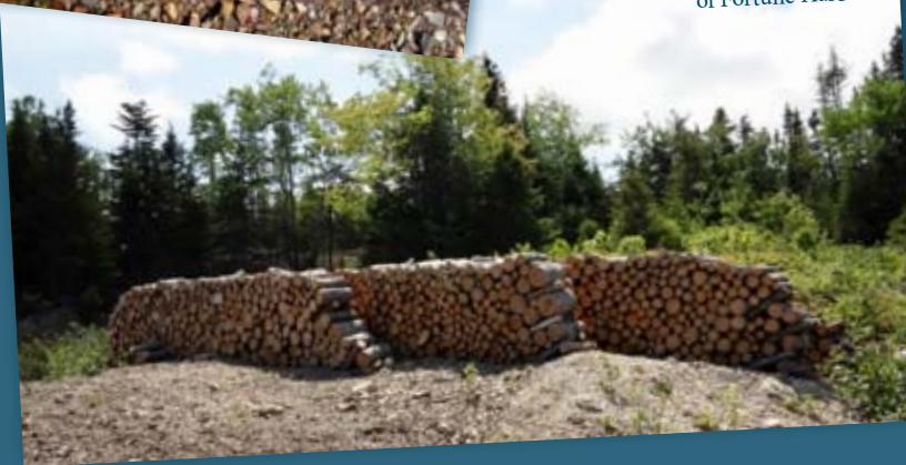
Timber in the hinterland of Fortune Harbour